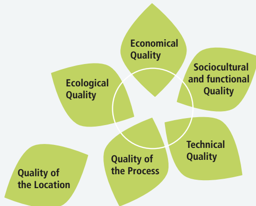
DGNB Certificate: the six areas of evaluation

As a clear and easily comprehensible rating system, the certificate covers all relevant fields of sustainable building and distinguishes outstanding buildings in gold, silver and bronze. Six areas of evaluation are singled out in the assessment: ecology, economy, socio-cultural and functional aspects, techniques, processes and location. The location is reported separately.